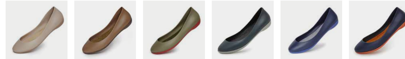
NUDE BEIGE F2-R-NB CAMEL BROWN F2-R-CB OLIVE GREEN F2-R-OG TEAL GREEN F2-R-TG SPLASH BLUE F2-R-SPB DEEP NAVY F2-R-DN