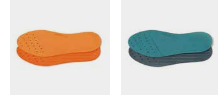
COMFORT INSOLE CI-ORANGE COMFORT INSOLE CI-TEAL