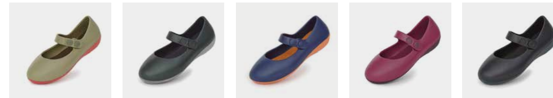
OLIVE GREEN MK-R-OG TEAL GREEN MK-R-TG DEEP NAVY MK-R-DN VINO PURPLE MK-R-VP SOLID BLACK MK-R-SB