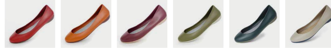
DENIM RED F2-R-DNR DENIM BROWN F2-R-DNB DENIM PURPLE F2-R-DNP DENIM GREEN F2-R-DNG PINE GREEN F2-R-PIG MIST GRAY F2-R-MG