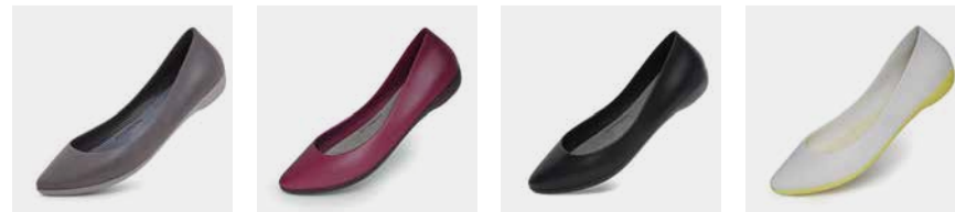
PEARL GRAY F2-P-PG VINO PURPLE F2-P-VP SOLID BLACK F2-P-SB LIGHT GRAY F2-P-LG