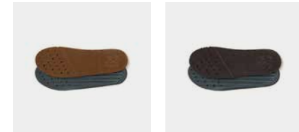
COMFORT INSOLE CI-BROWN COMFORT INSOLE CI-BLACK