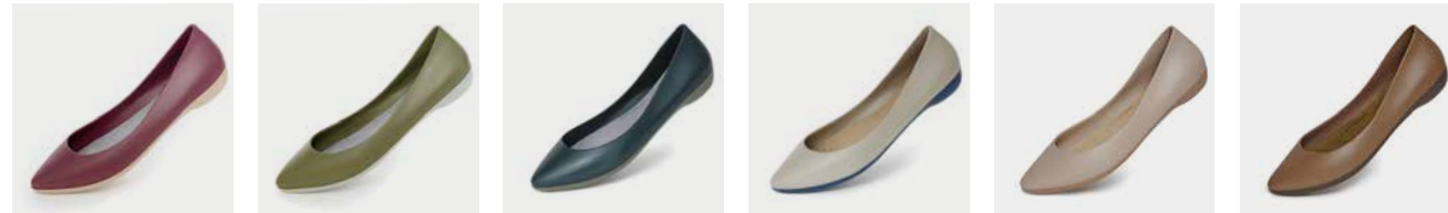
DENIM PURPLE F2-P-DNP DENIM GREEN F2-P-DNG PINE GREEN F2-P-PIG MIST GRAY F2-P-MG NUDE BEIGE F2-P-NB CAMEL BROWN F2-P-CB