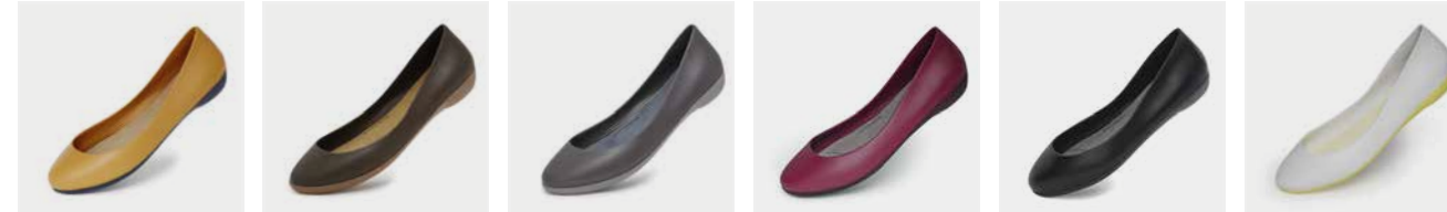
MUSTARD YELLOW F2-R-MY DARK BROWN F2-R-DB PEARL GRAY F2-R-PG VINO PURPLE F2-R-VP SOLID BLACK F2-R-SB LIGHT GRAY F2-R-LG