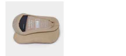
HIDDEN SOCKS SO-M/L