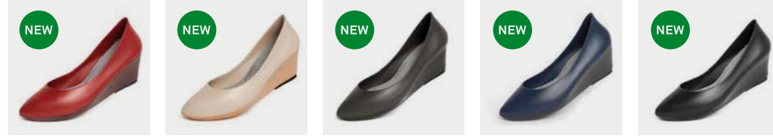
DENIM RED W6-P-DNR NUDE BEIGE W6-P-NB ASH GRAY W6-P-AG DEEP NAVY W6-P-WDN SOLID BLACK W6-P-WSB