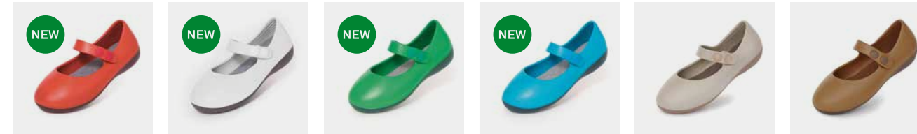
CANDY RED MK-R-CNR CANDY GRAY MK-R-CNG CANDY GREEN MK-R-CNGR CANDY BLUE MK-R-CNB NUDE BEIGE MK-R-NB CAMEL BROWN MK-R-CB