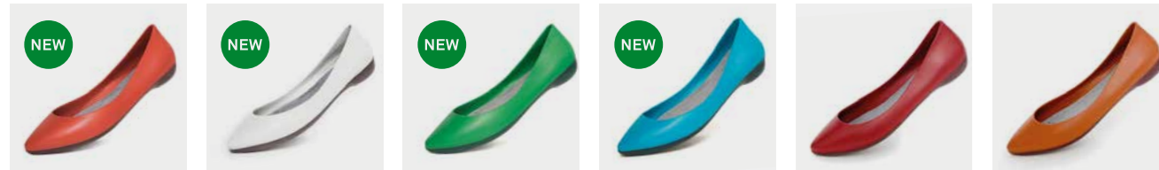
CANDY RED F2-P-CDR CANDY GRAY F2-P-CDG CANDY GREEN F2-P-CDGR CANDY BLUE F2-P-CDB DENIM RED F2-P-DNR DENIM BROWN F2-P-DNB