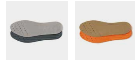
COMFORT INSOLE CI-GRAY COMFORT INSOLE CI-BROWN