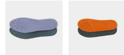
COMFORT INSOLE CI-BLUE COMFORT INSOLE CI-ORANGE