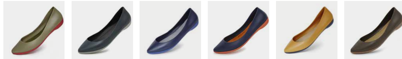
OLIVE GREEN F2-P-OG TEAL GREEN F2-P-TG SPLASH BLUE F2-P-SPB DEEP NAVY F2-P-DN MUSTARD YELLOW F2-P-MY DARK BROWN F2-P-DB